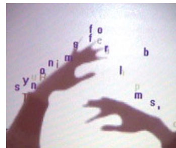
Text Rain, 1999