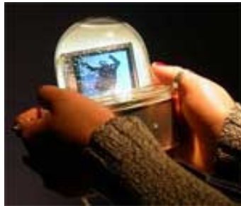
Potent Objects, 2003