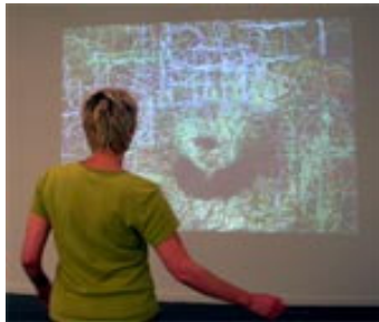
External Measures, 2003

<Composition, 2000>, <Text Rain, 1999>. Expected and possible interactions by audiences for the chosen works were direct and easy to understand intention of the artists. While looking at the works in a gallery, the visitors ‘play’ with them, using their bodies for interaction.