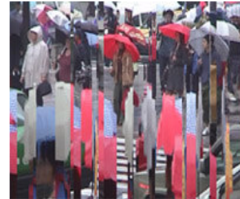
Liquid Time Series, 2001-2002